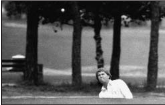
Davis Love III contributed to 17 team titles in addition to his six individual collegiate crowns.